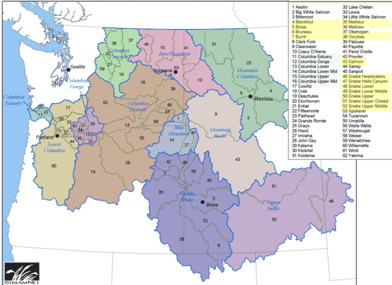
Columbia River Basin Subbasins